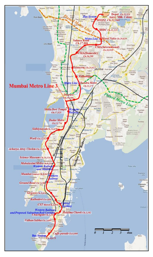
Figure 1 Alignment of Mumbai Metro Line 3

MMRC will procure civil Contractors for all packages at once.